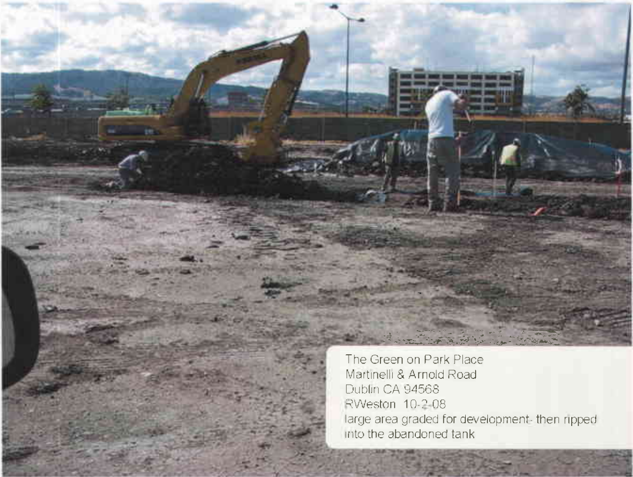
The Green on Park Place Martinelli & Arnold Road Dublin CA 94568 RWeston 10-2-08 large area graded for development- then ripped into the abandoned tank