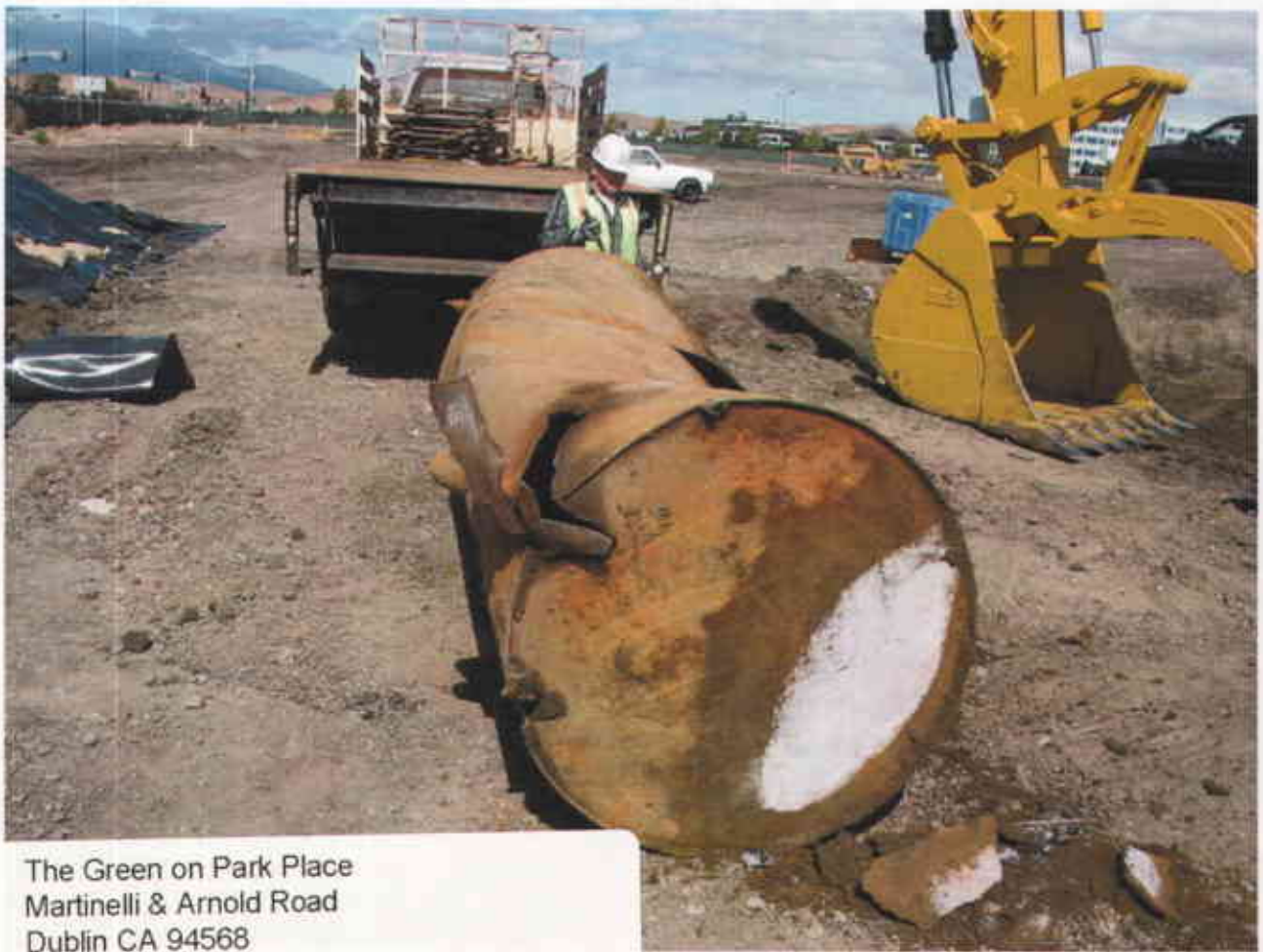
The Green on Park Place Martinelli & Arnold Road Dublin CA 94568 RWeston 10-2-08 UST removed and ready to sample soil