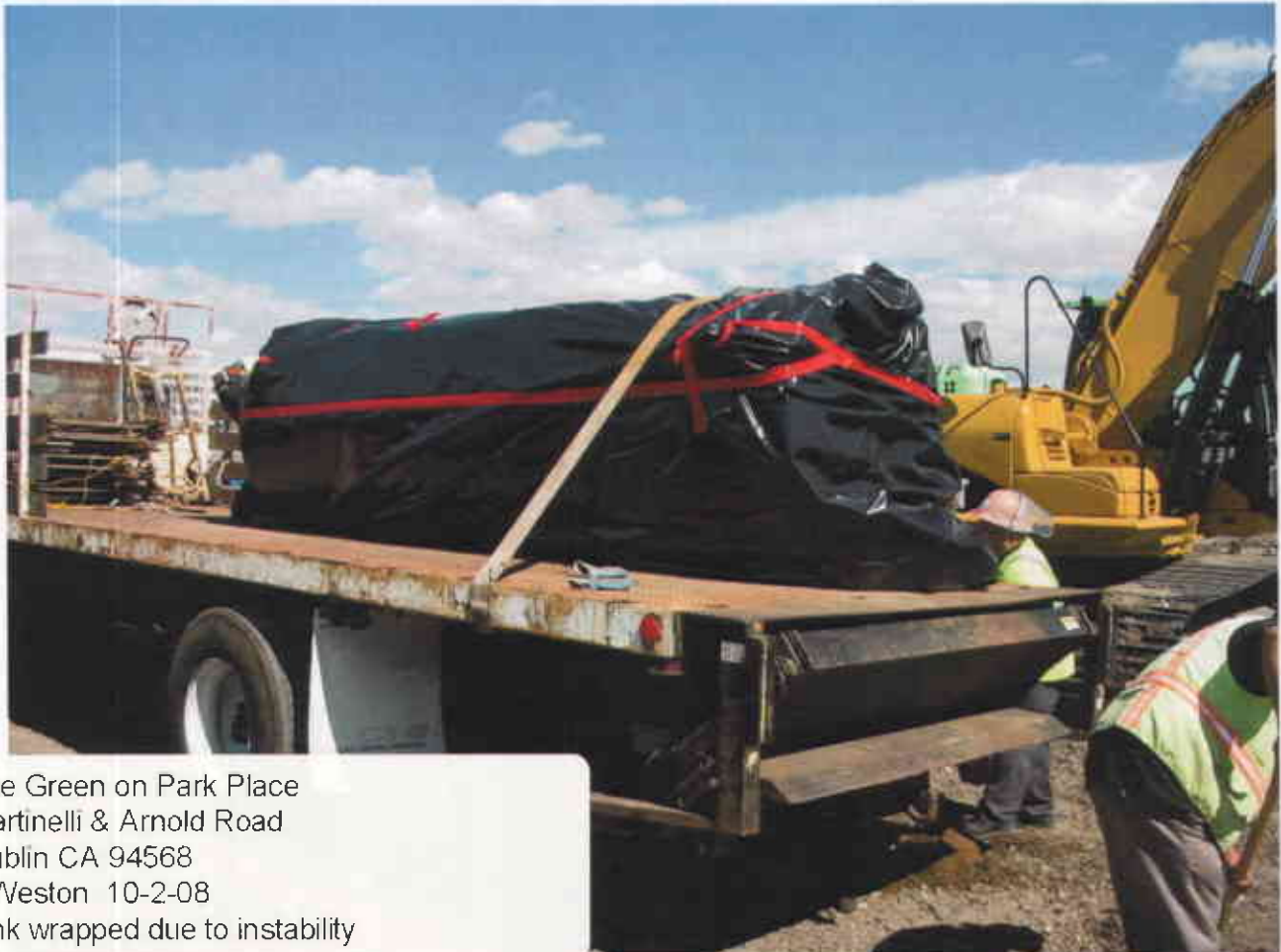
The Green on Park Place Martinelli & Arnold Road Dublin CA 94568 RWeston 10-2-08 tank wrapped due to instability