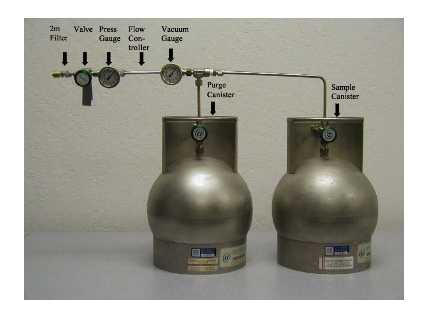
Figure 3 Typical Soil Gas Sampling Manifold 8410 Amelia Street Oakland, California

P&D Environmental, Inc. 55 Santa Clara Ave., Suite 240 Oakland, CA 94610