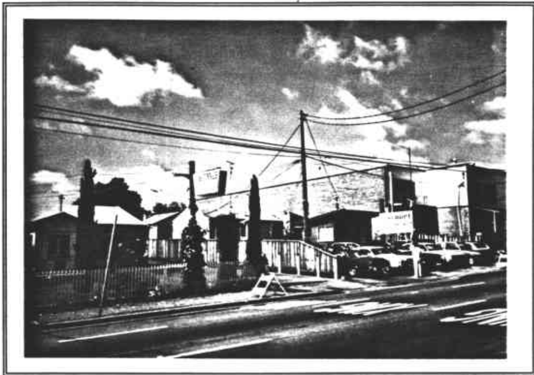
Photo 1: The Discount Auto Sales office is in the foreground, and the three on-site residences are in the background (facing north).