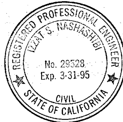
Izzat Nashashibi IN:scf