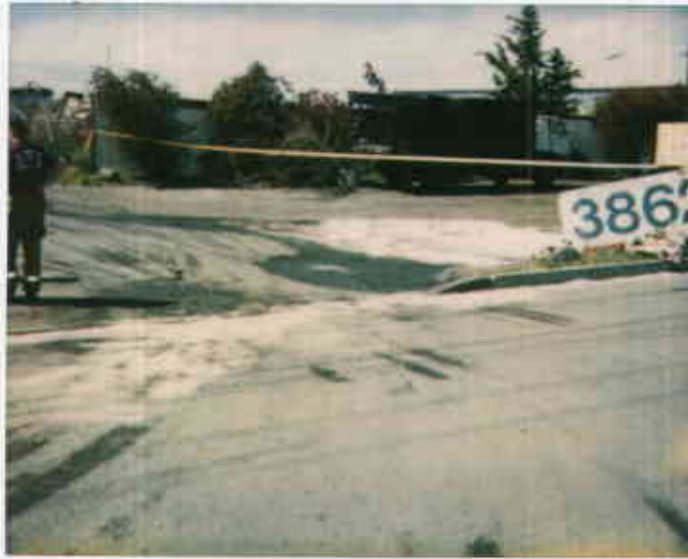
3862 Depot Rd., Hayward 5/5/94 JS Freemiller Trucking Diesel Spill