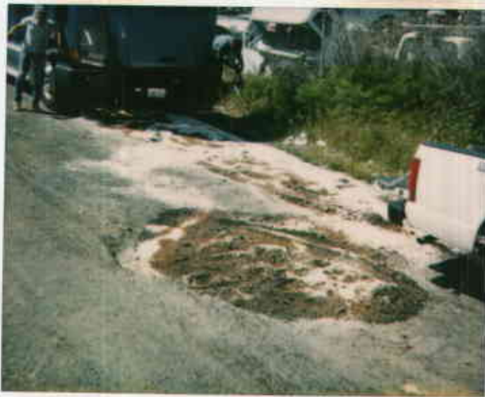
3862 Depot Road, Hayward 5/5/94 JS Freemiller Trucking Diesel Spill.