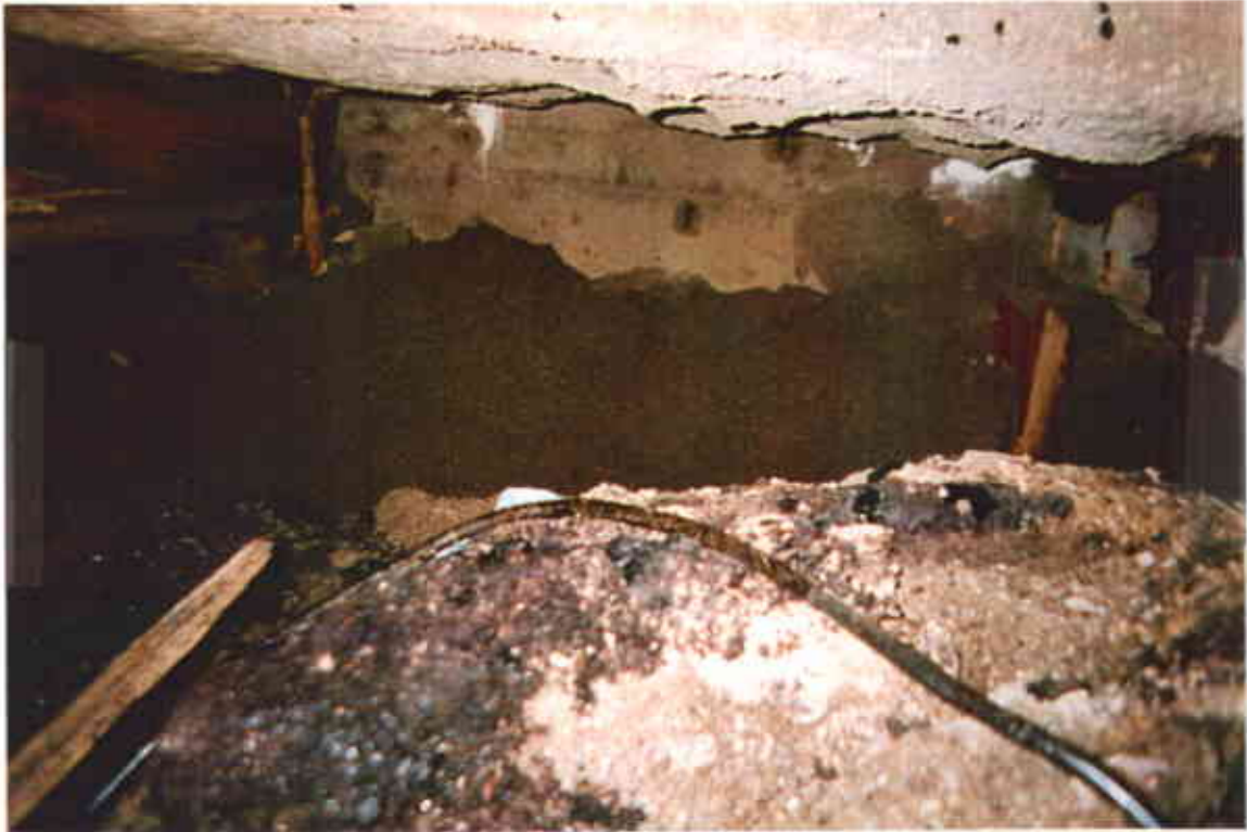
UST Vault Interior