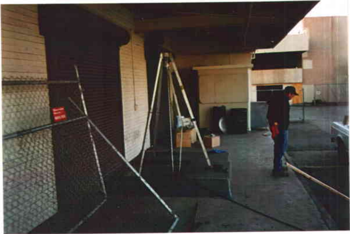
Shaft Access to UST