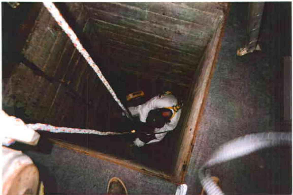
Hand Excavation and Dewatering