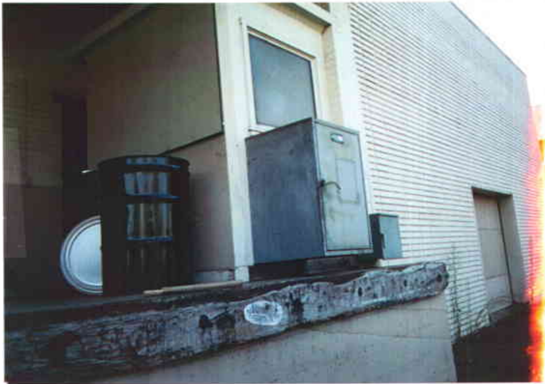
"Tri-Wall" Containing Excavated Soil