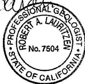
Robert A. Lauritzen Senior Geologist, P.C. No. 7504

Figure 1: Groundwater Elevation Map Table 1: Groundwater Monitoring Data and Analytical Results Table 2: Groundwater Analytical Results Attachments: Standard Operating Procedure - Groundwater Sampling Field Data Sheets Chain of Custody Document and Laboratory Analytical Reports