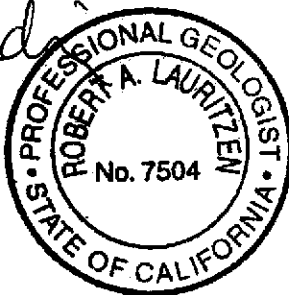
Robert A. Lauritzen Senior Geologist, P.G. No. 7504

Figure 1: Potentiometric Map Table 1: Groundwater Monitoring Data and Analytical Results Table 2: Groundwater Analytical Results - Oxygenate Compounds Attachments: Standard Operating Procedure - Groundwater Sampling Field Data Sheets Chain of Custody Document and Laboratory Analytical Reports