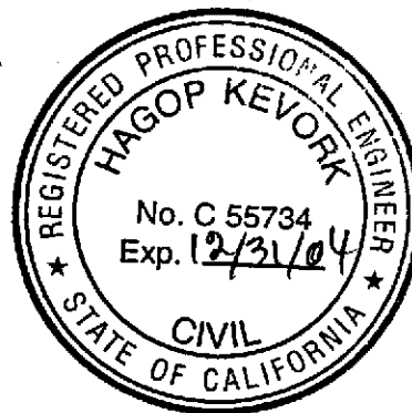
Hagop Kevork P.E. No. C55734

Figure 1: Potentiometric Map Table 1: Groundwater Monitoring Data and Analytical Results Table 2: Groundwater Analytical Results - Oxygenate Compounds Attachments: Standard Operating Procedure - Groundwater Sampling Field Data Sheets Chain of Custody Document and Laboratory Analytical Reports