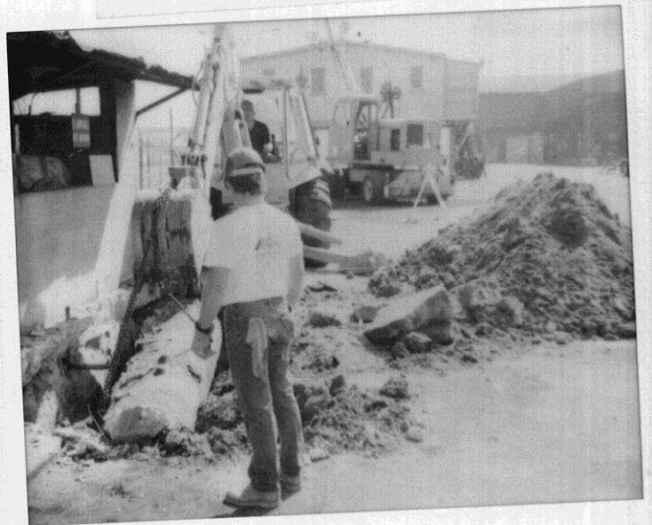
1441 Embarcadero Pacific D.D. 9/24/91