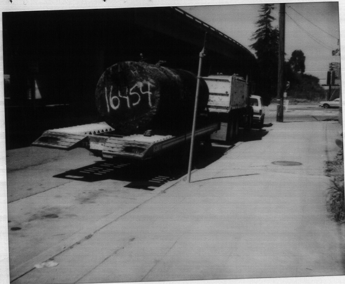
8/31/95 3623 Adeline St. Emeryville