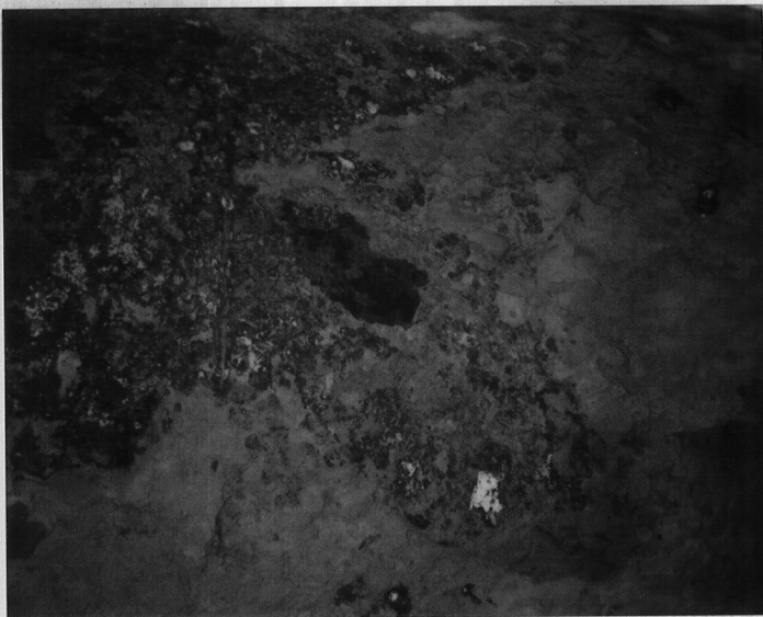
2200 CENTRAL ALAMEDA REMOVED TANK EXTERIOR SHOWING PITTING