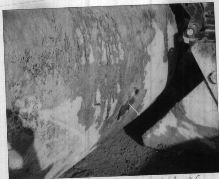
ENLARGED AREA PHOTO, SHOWING HOLE IN 2000 GAL TANK, 2ND TANK 2200 CENTRAL, 1-8-92 (PW)