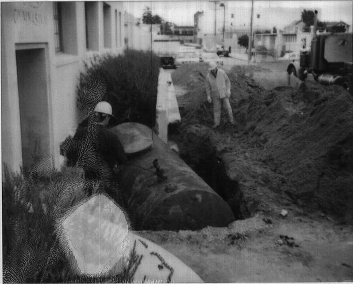
2200 CENTRAL ALAMEDA 12/27/91 TANK REMOVAL