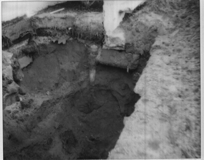
2200 CENTRAL AVE ALAMEDA TANK PIT W/ FALL LINE TO LOWER TANK