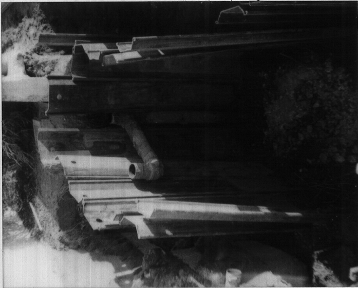
2200 CENTRAL AVE ALAMEDA SEMCO JOB 1-3-92 W/ EDDY SO SECOND TANK REMOVAL W/ SHORING