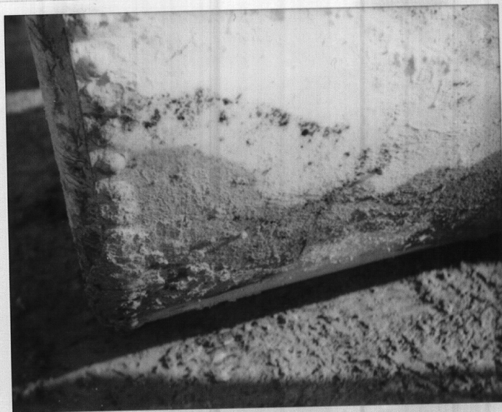
AREA OF STAINING AT BOTTOM OF 2000 GAL TANK. 2200 CENTRAL 1-8-92 (PW)