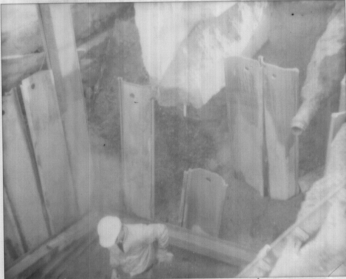
PIT AFTER REMOVAL OF SECOND 2000 GAL TANK 2200 CENTRAL 1-8-92 RW