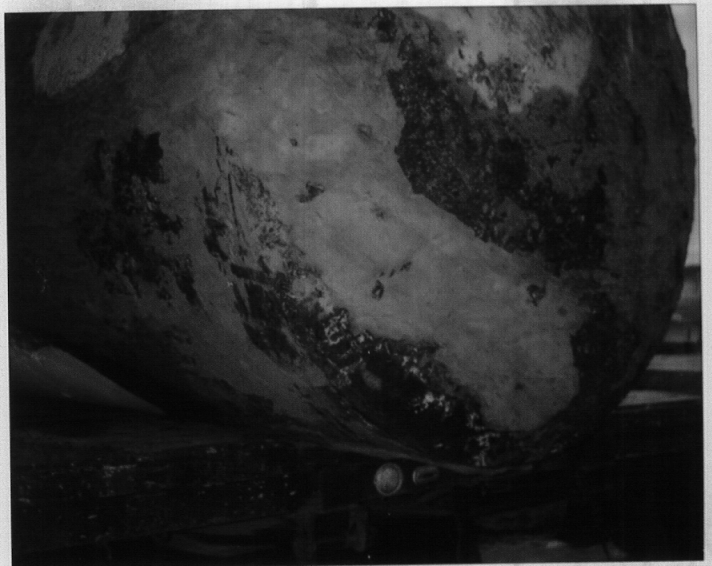
TANK ON TRUCK BED END VIEW, TANK SCRAPPED OF SOIL