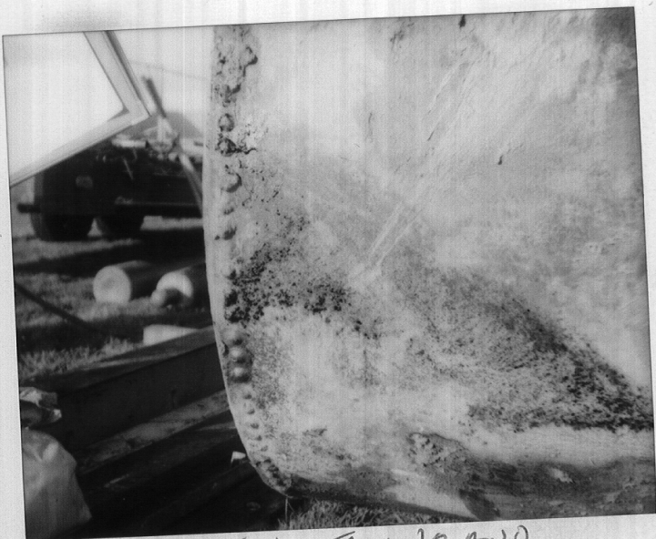
PICTURE SHOWS STAINING AND SEEPAGE OF HEAVY OIL CONSTITUENTS 2200 CENTRAL 1-8-92 (PW) (2ND TANK)