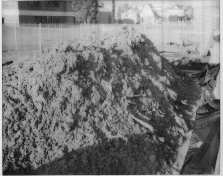
STOCKPILED SOIL ON PLASTIC SHEETING 2200 CENTRAL 1-8-92 RW