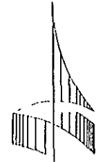
FIGURE NUMBER 20