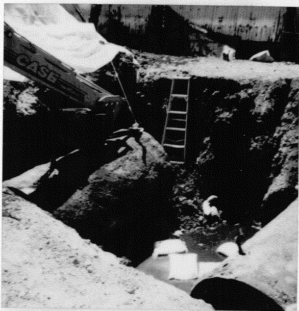
Alita Brand 968-81st St Oakland 2-1000 gallon VST (gasoline & diesel) 8/16/96