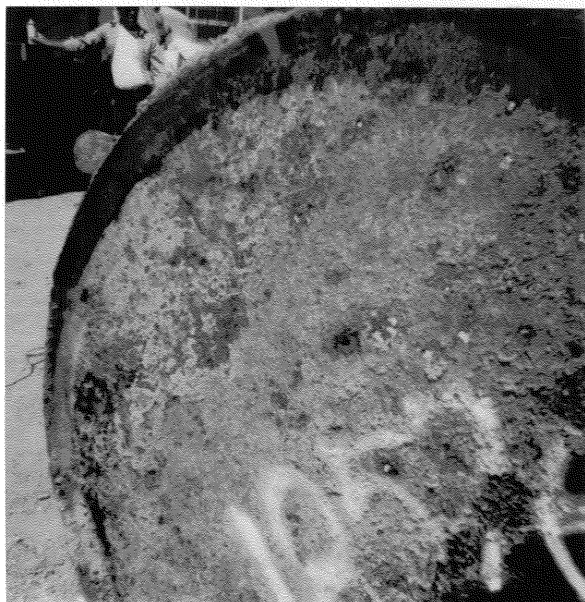
D. Merlino & Sons 976-81st Ave. Oakland 1,000-gal gasoline VST w/ holes 8/16/96