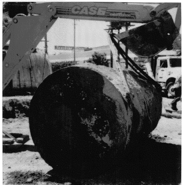
968-81st St., Oakland