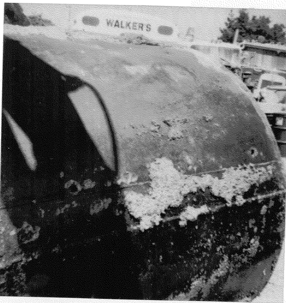
968-81st St., Oakland