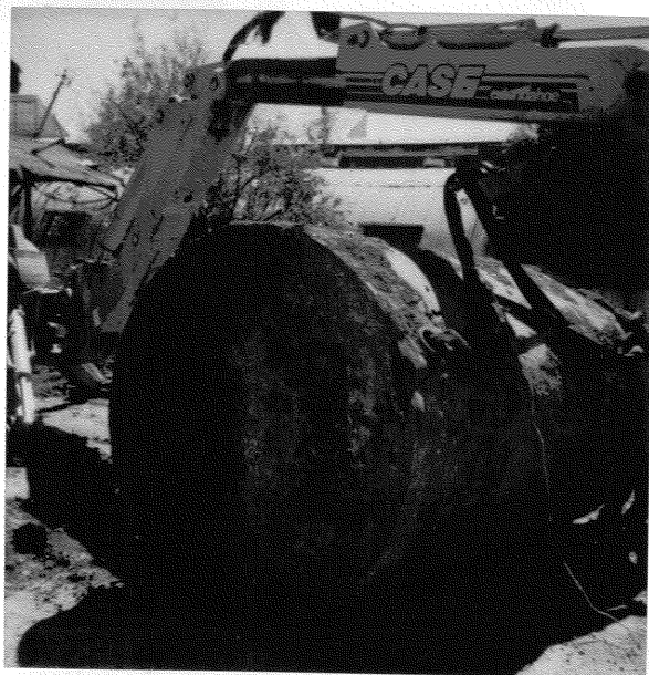
D. Merlino & Sons 976-81st Ave. Oakland 1,000-gallon gasoline VST w/ holes 8/16/96