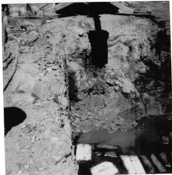
968-81st St, Oakland 8/16/96 Grey stain on dirt sidewalk