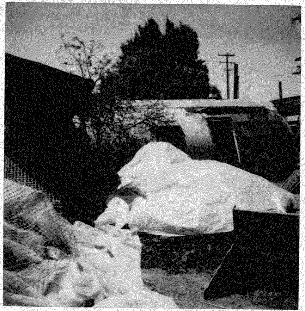
968-81st St Oakland CA Stockpile Soil.