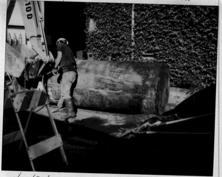
1/12/94 1,000 gallon gasoline tank removed