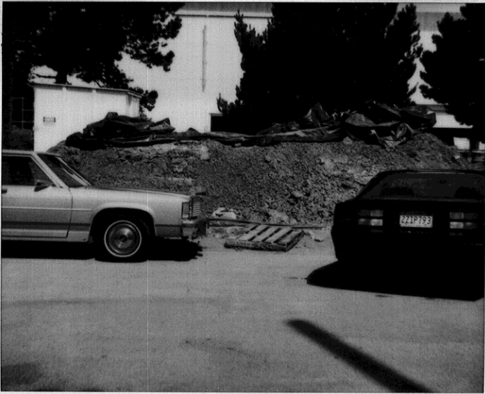
Pile C Coulter Steel