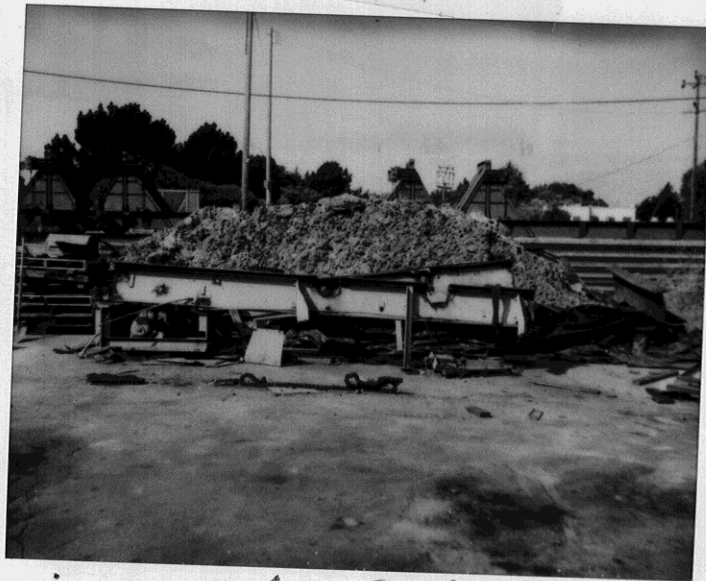
100 yds near railroad track Coulter Steel 9/14/92 Pile A