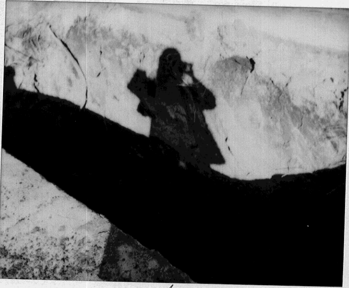
ST101385 1/12/94 tank pit gasoline