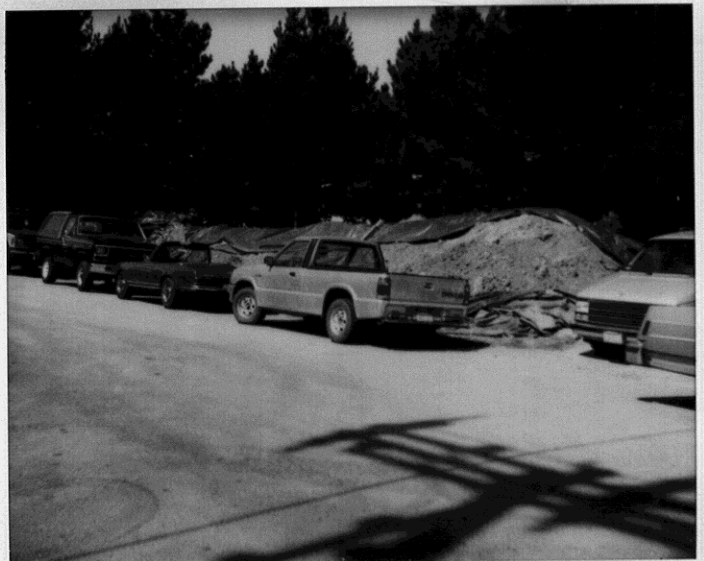
Pile B Coulter Steel