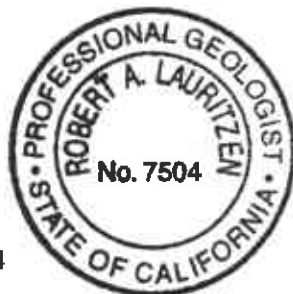
Robert A. Lauritzen Senior Geologist, P.G. No. 7504

Figure 1: Potentiometric Map Table 1: Groundwater Monitoring Data and Analytical Results Table 2: Separate Phase Hydrocarbon Thickness/Removal Data Table 3: Groundwater Analytical Results - Oxygenate Compounds Attachments: Standard Operating Procedure - Groundwater Sampling Field Data Sheets Chain of Custody Document and Laboratory Analytical Reports