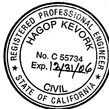
Hagop Kevork P.E. No. C55734

Figure 1: Groundwater Elevation Map Table 1: Groundwater Monitoring Data and Analytical Results Table 2: Groundwater Analytical Results - Oxygenate Compounds Table 3: Groundwater Analytical Results Attachments: Standard Operating Procedure - Groundwater Sampling Field Data Sheets Chain of Custody Document and Laboratory Analytical Reports