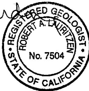
Robert A. Lauritzen Senior Geologist, R.G. No. 7504

Figure 1: Groundwater Elevation Map Table 1: Groundwater Monitoring Data and Analytical Results Table 2: Groundwater Analytical Results - Oxygenate Compounds Table 3: Groundwater Analytical Results Attachments: Standard Operating Procedure - Groundwater Sampling Field Data Sheets Chain of Custody Document and Laboratory Analytical Reports