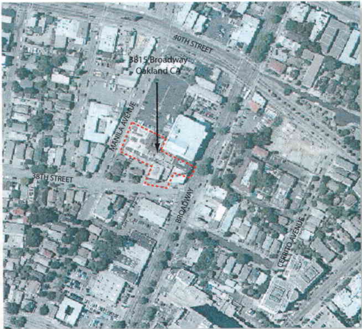
Figure 1: Site vicinity map.