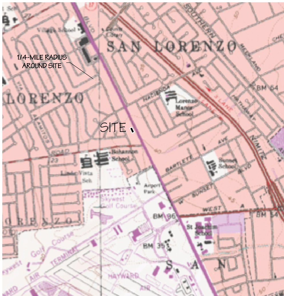
SITE LOCATION MAP HUTCH'S CARWASH 17945 HESPERIAN BOULEVARD SAN LORENZO, CA AQUA SCIENCE ENGINEERS, INC. Figure 1