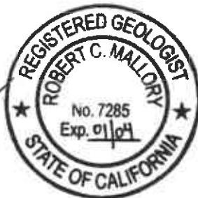
Robert C. Mallory Registered Geologist, No. 7285

Figure 1: Potentiometric Map Figure 2: Concentration Map Table 1: Groundwater Monitoring Data and Analytical Results Table 2: Groundwater Analytical Results - Oxygenate Compounds Table 3: Field Measurements Attachments: Standard Operating Procedure - Groundwater Sampling Field Data Sheets Chain of Custody Document and Laboratory Analytical Reports