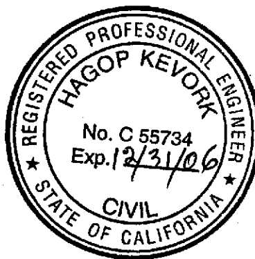
Hagop Kevork P.E. No. C55734

Figure 1: Potentiometric Map Table 1: Groundwater Monitoring Data and Analytical Results Table 2: Field Measurements and Groundwater Analytical Results Attachments: Standard Operating Procedure - Groundwater Sampling Field Data Sheets Chain of Custody Document and Laboratory Analytical Reports