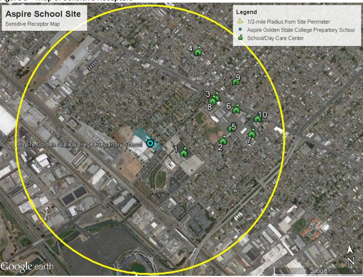
Figure 3 – Map of Sensitive Receptors