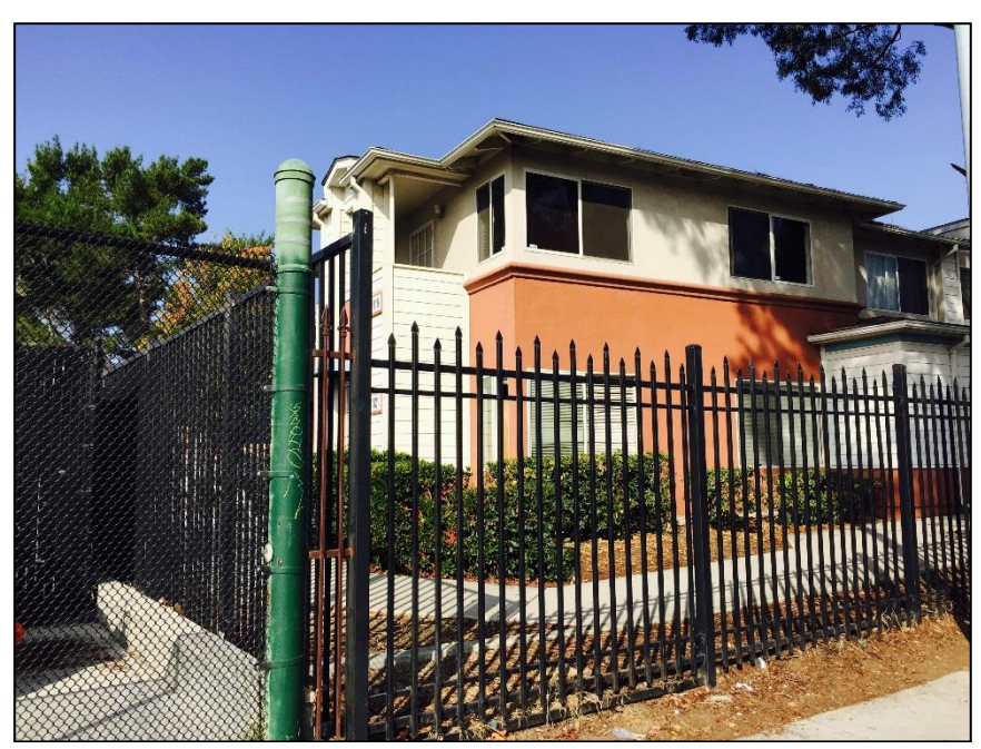
Affordable housing complex northeast of the site