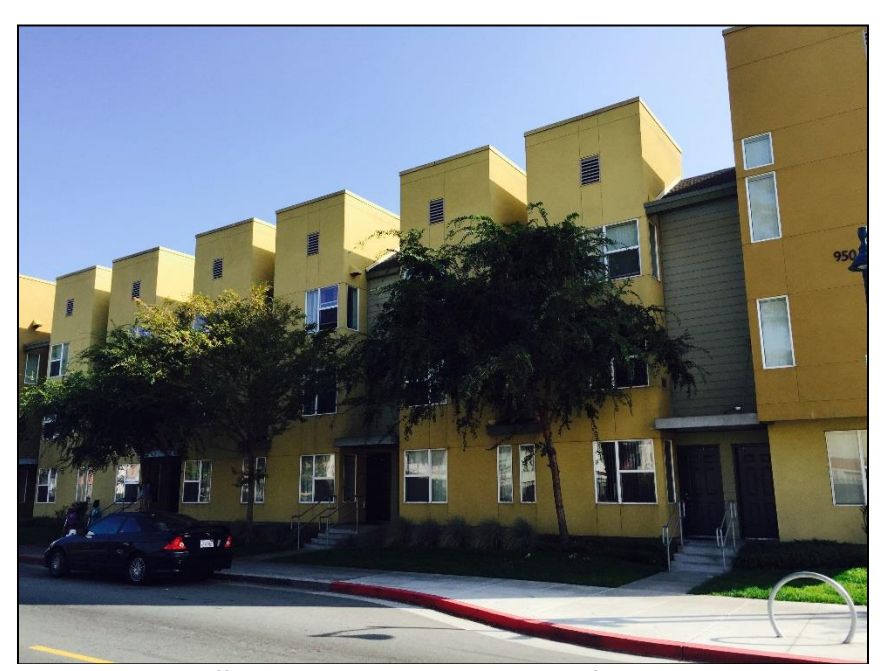
Affordable housing complex south of the site