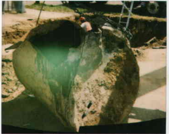
250 gallon Used-Oil UST (Tank C) 3250 School St., Oakland, CA