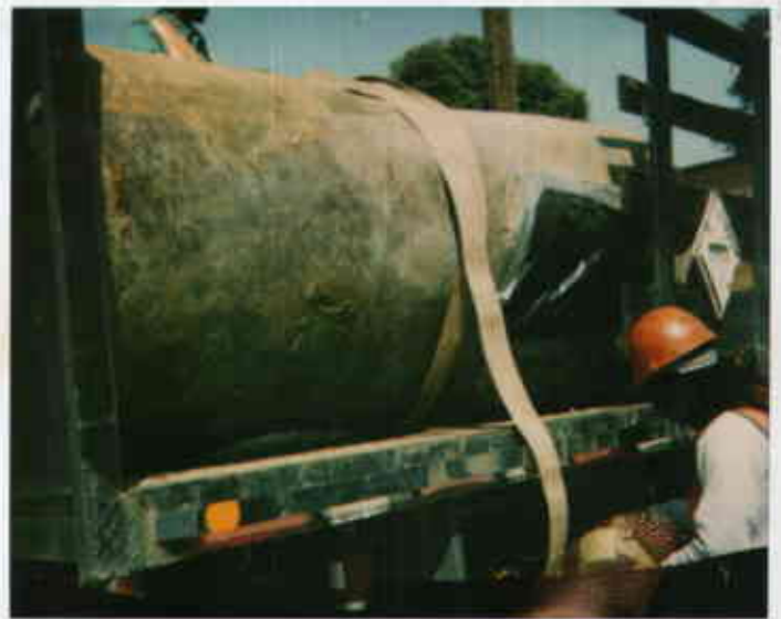
Tank A - no holes noted w/ slight 750 gallon gasoline pitting 3250 School St., Oakland, CA