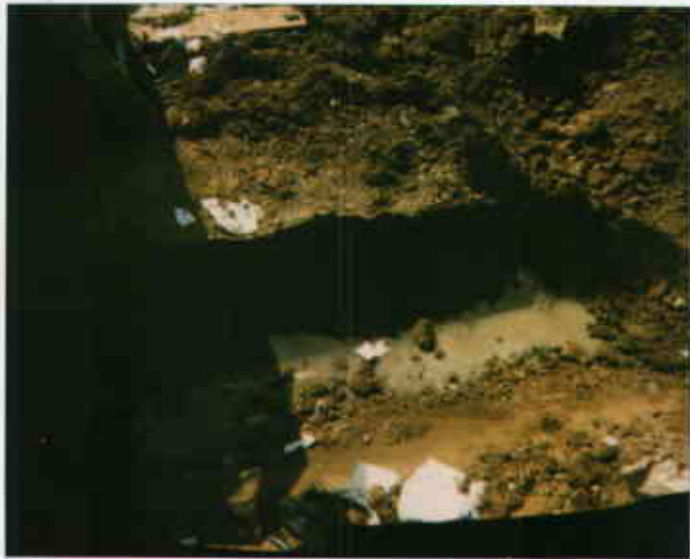
Ground Water noted under Tank B at Not GW! GW not found to depth of approx 14" 14" 1995 "7 1/2" 3250 School St., Oakland