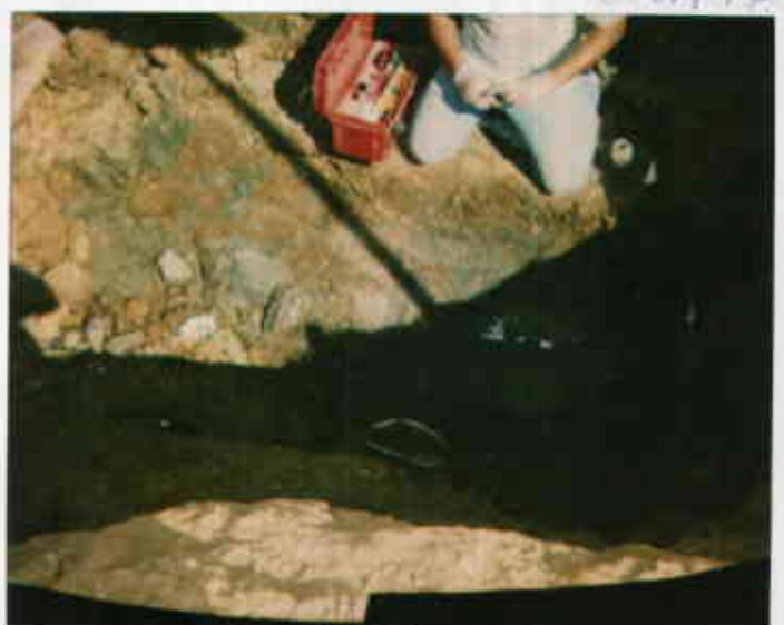
Ground water Water noted under Tank A will not analyze Samples collected GA-1 Not GW! 3250 School St., Oakland, CA