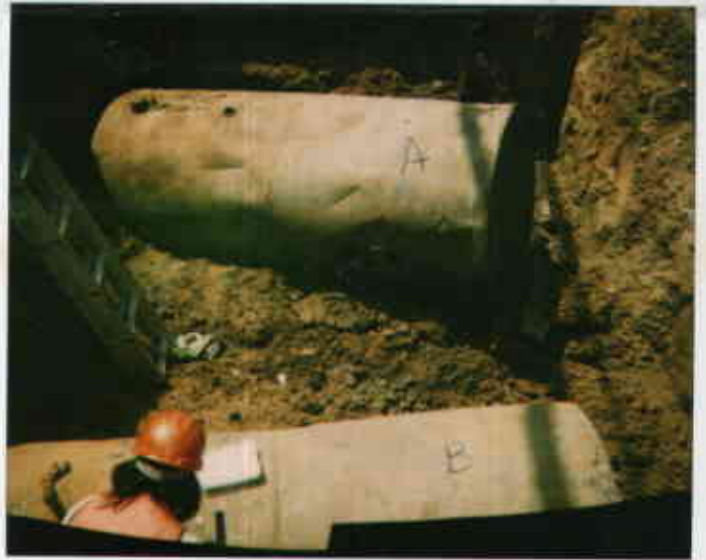
2 Gasoline USTs approx 750 gallon (Tank A - background & Tank B foreground) 3250 School St. Oakland, CA