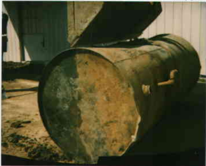
Tank B - 750 gallon gasoline UST 3250 School St., Oakland