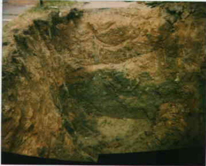
Facing Maple Ave stained soil side of excavation facing west in gasoline UST pit.