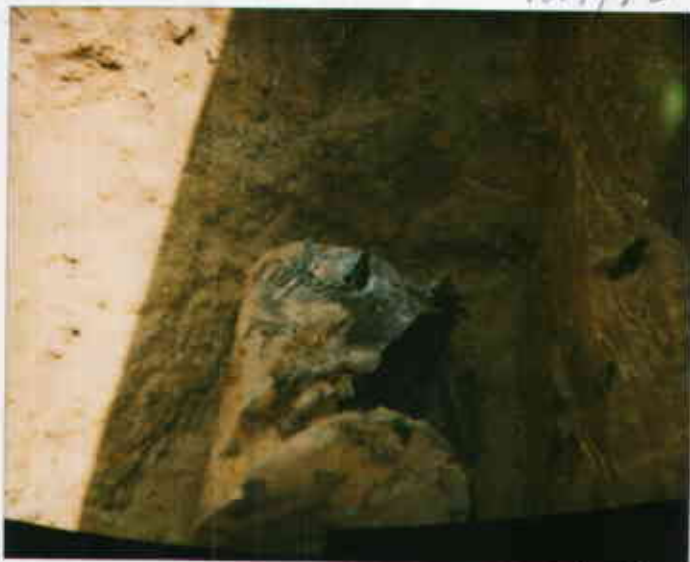
250 gallon Used Oil UST (Tank C) 3250 School St., Oakland, CA