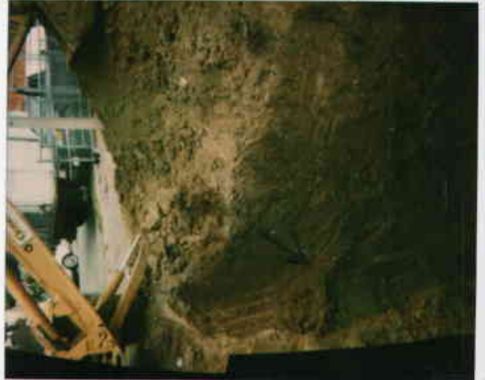
Facing Building - 3250 School St. Oakland slight staining noted on north/northeast wall of gas UST pit.