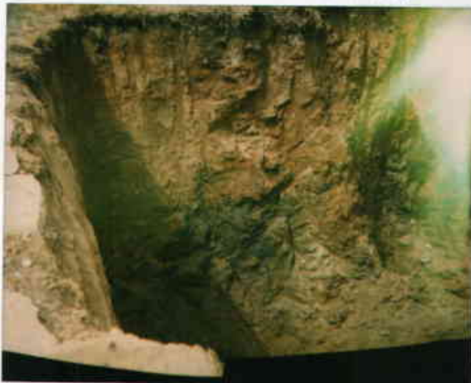
Facing School St. 3250 School St. Oakland stained soil in gasoline tank pit facing south/southwest.