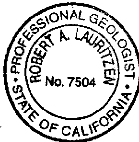
Robert A. Lauritzen Senior Geologist, P.G. No. 7504

Figure 1: Potentiometric Map Table 1: Groundwater Monitoring Data and Analytical Results Table 2: Groundwater Analytical Results - Oxygenate Compounds Attachments: Standard Operating Procedure - Groundwater Sampling Field Data Sheets Chain of Custody Document and Laboratory Analytical Reports