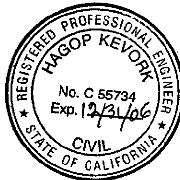
Hagop Kevork P.E. No. C55734

Figure 1: Potentiometric Map Table 1: Groundwater Monitoring Data and Analytical Results Table 2: Separate Phase Hydrocarbon Thickness/Removal Data Table 3: Dissolved Oxygen Concentrations Attachments: Standard Operating Procedure - Groundwater Sampling Field Data Sheets Chain of Custody Document and Laboratory Analytical Reports