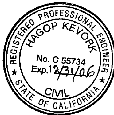
Hagop Kevork P.E. No. C55734

Figure 1: Potentiometric Map Table 1: Groundwater Monitoring Data and Analytical Results Table 2: Dissolved Oxygen Concentrations Table 3: Groundwater Analytical Results Attachments: Standard Operating Procedure - Groundwater Sampling Field Data Sheets Chain of Custody Document and Laboratory Analytical Reports