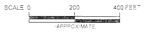
GROUNDWATER MONITORING B & C GAS MINI MART LIVERMORE, CALIFORNIA SITE VICINITY AND PROPOSED WELL LOCATIONS