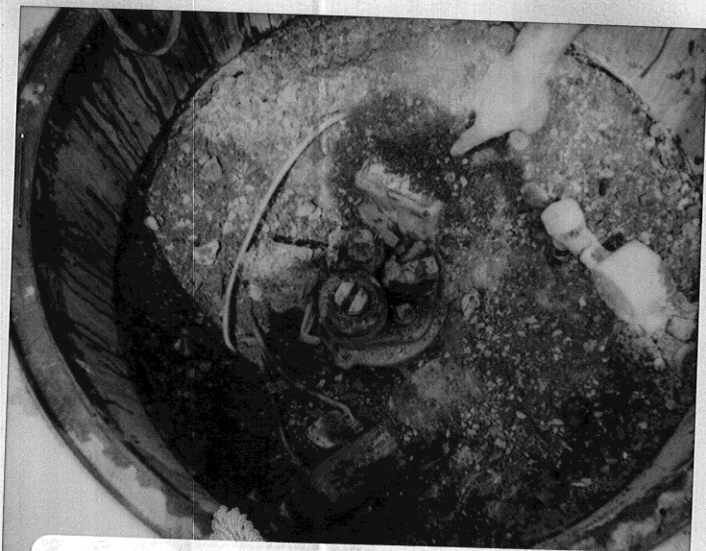
B&C Gas and Minimart 2008 First Street Livermore Photos taken 6/15/95 by RWeston