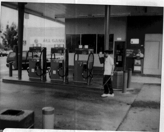
B&C Gas and Minimart 2008 First Street Livermore Photos taken 6/15/95 by RWeston