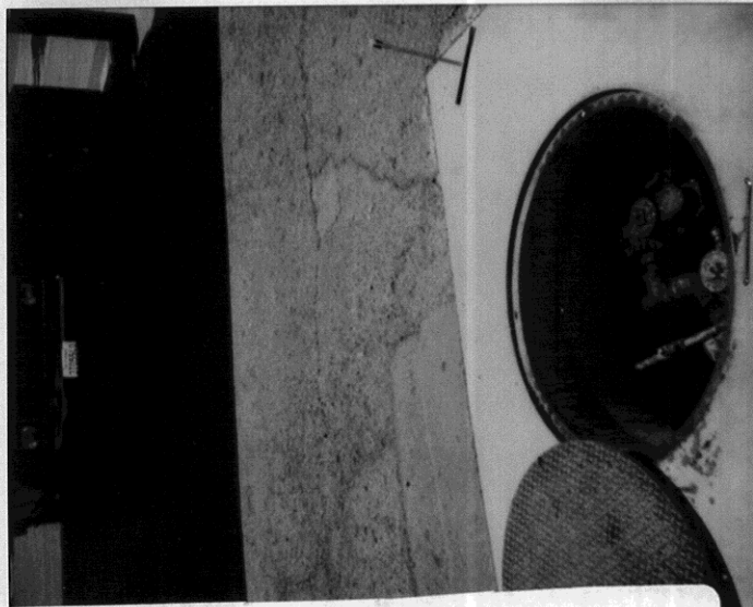
B&C Gas and Minimart 2008 First Street Livermore Photos taken 6/15/95 by RWeston