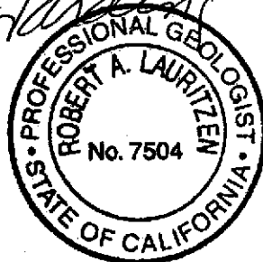
Robert A. Lauritzen Senior Geologist, P.G. No. 7504

Figure 1: Groundwater Elevation Map Table 1: Groundwater Monitoring Data and Analytical Results Table 2: Groundwater Analytical Results - Oxygenate Compounds Attachments: Standard Operating Procedure - Groundwater Sampling Field Data Sheets Chain of Custody Document and Laboratory Analytical Reports