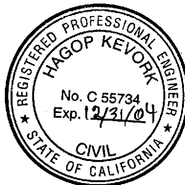
Hagop Kevork P.E. No. C55734

Figure 1: Groundwater Elevation Map Table 1: Groundwater Monitoring Data and Analytical Results Table 2: Groundwater Analytical Results - Oxygenate Compounds Attachments: Standard Operating Procedure - Groundwater Sampling Field Data Sheets Chain of Custody Document and Laboratory Analytical Reports