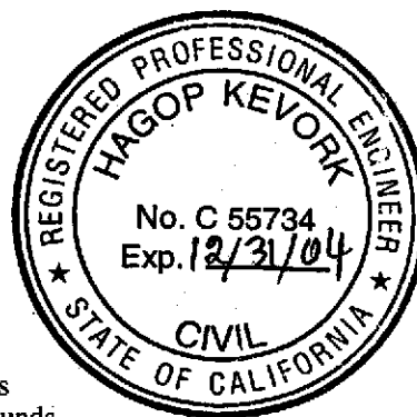
Hagop Kevork P.E. No. C55734

Figure 1: Groundwater Elevation Map Table 1: Groundwater Monitoring Data and Analytical Results Table 2: Groundwater Analytical Results - Oxygenate Compounds Attachments: Standard Operating Procedure - Groundwater Sampling Field Data Sheets Chain of Custody Document and Laboratory Analytical Reports