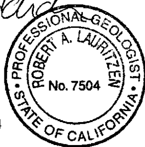
Robert A. Lauritzen Senior Geologist, P.G. No. 7504

Figure 1: Potentiometric Map Table 1: Groundwater Monitoring Data and Analytical Results Table 2: Groundwater Analytical Results - Oxygenate Compounds Attachments: Standard Operating Procedure - Groundwater Sampling Field Data Sheets Chain of Custody Document and Laboratory Analytical Reports