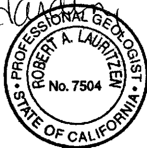
Robert A. Lauritzen Senior Geologist, P.G. No. 7504

Figure 1: Potentiometric Map Table 1: Groundwater Monitoring Data and Analytical Results Table 2: Dissolved Oxygen Concentrations Table 3: Groundwater Analytical Results - Oxygenate Compounds Attachments: Standard Operating Procedure - Groundwater Sampling Field Data Sheets Chain of Custody Document and Laboratory Analytical Reports