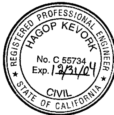
Hagop Kevork P.E. No. C55734

Figure 1: Potentiometric Map Table 1: Groundwater Monitoring Data and Analytical Results Table 2: Dissolved Oxygen Concentrations Table 3: Groundwater Analytical Results - Oxygenate Compounds Attachments: Standard Operating Procedure - Groundwater Sampling Field Data Sheets Chain of Custody Document and Laboratory Analytical Reports