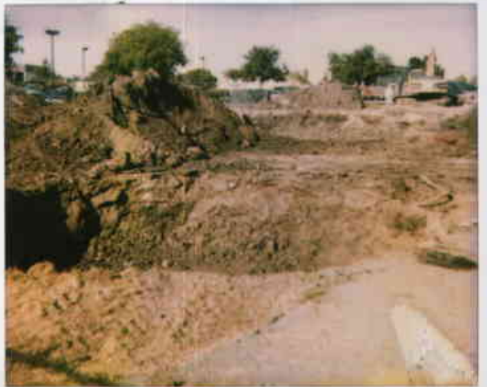
WEDS 4/10/96 PUMP ISLAND AND LARGE EXCAVATION