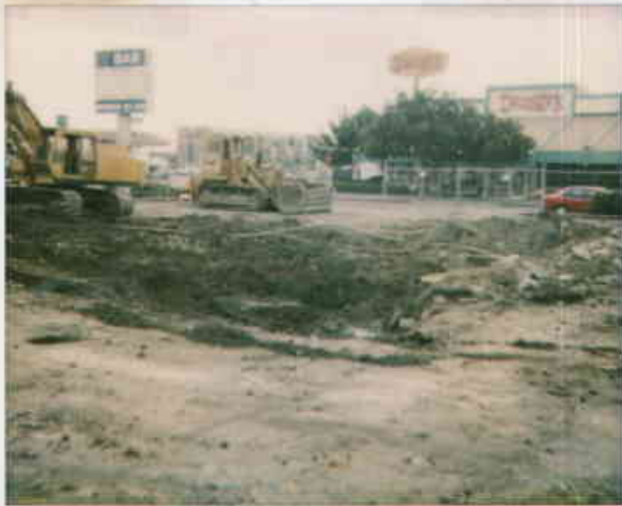
625 Hwy Rd OITC 10/21/93