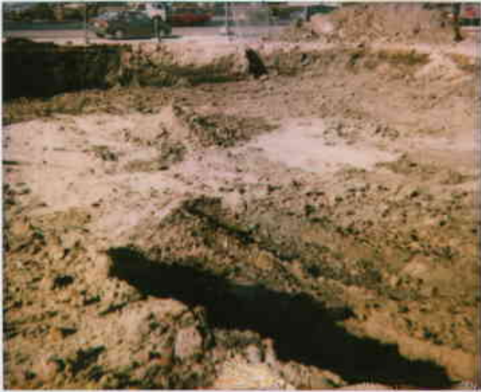
WEDS 4/10/96 LARGE EXCAVATION