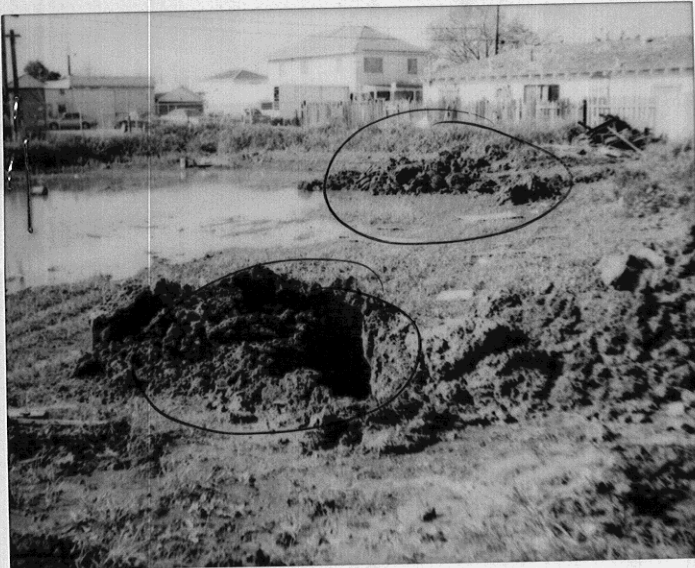
4/2/91 342 105th Ave 2 pits dug ~20' on east + south side