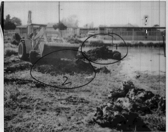
4/2/91 342 105th Ave 1- pit @ ~20' on west side 2- sample @ ~12.5'