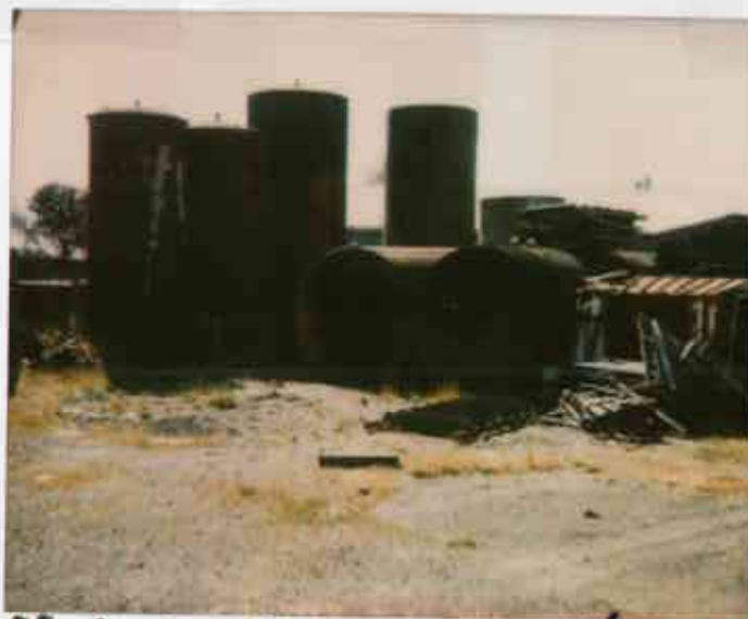
Holland Oil 16301 E. 14 San Leandro