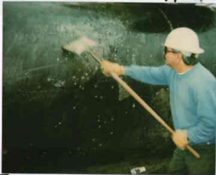
tank bottom - holes, pits