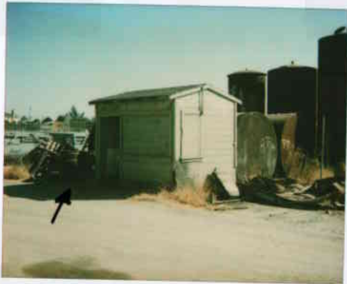
Holland Oil 8-14-98 16301 E. 14th San Leandro