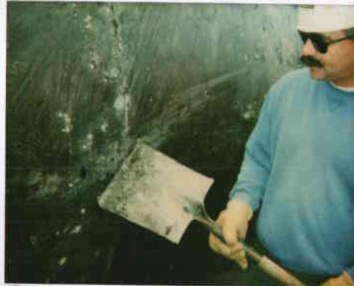
tank bottom - holes