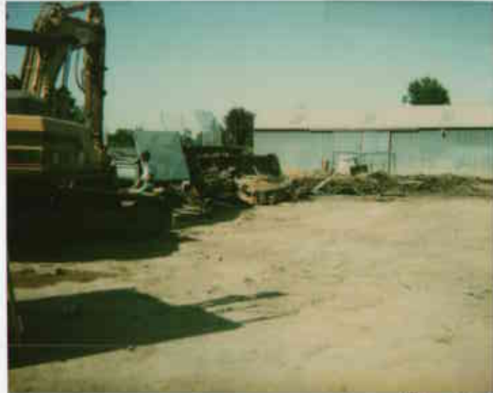
Holland Oil 9-4-95