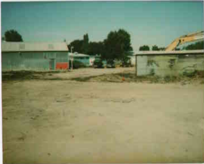
Holland Oil 9-4-95