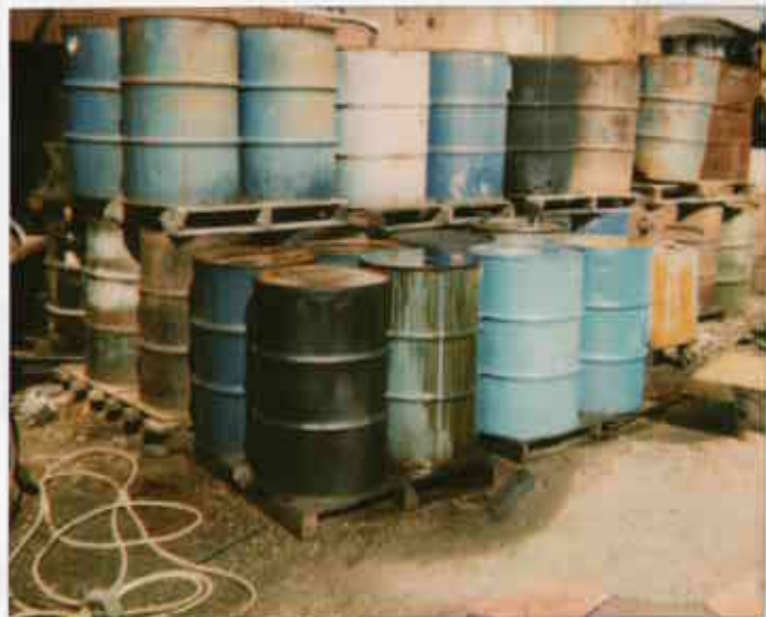
Holland Oil 16301 E. 14th San Leandro