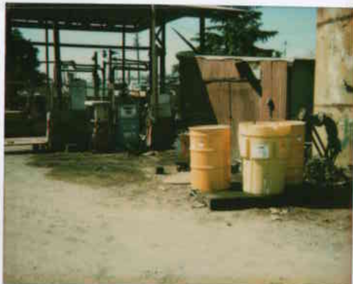
PCB 8-14-98 Holland Oil 16301 E. 14th San Leandro