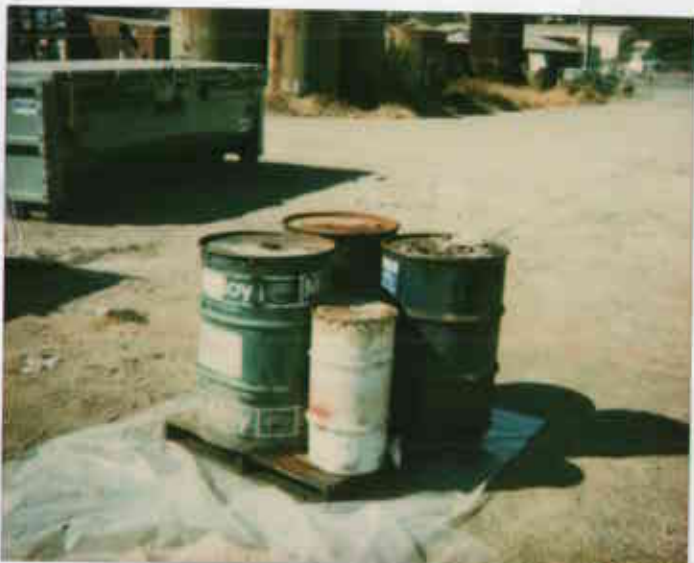
Holland Oil 8-14-98 16301 E. 14th San Leandro