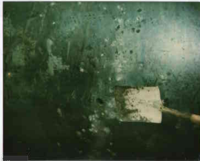
tank bottom - holes