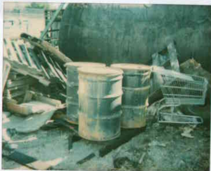
Holland Oil 8-14-98 16301 E. 14th S. Leandro