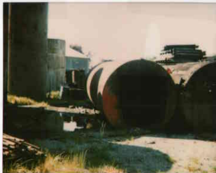
Holland Oil 16301 E. 14th San Leandro