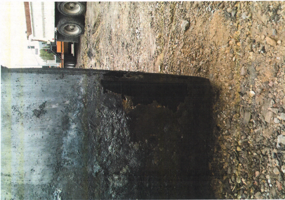
Corrossion Hole in UST 2ft by 1ft