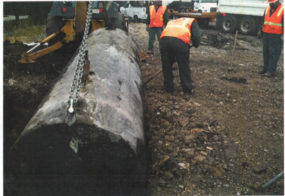
UST exterior cleaning