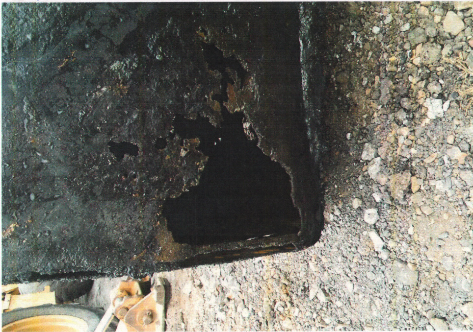
Corrossion Hole 1ft x 1ft