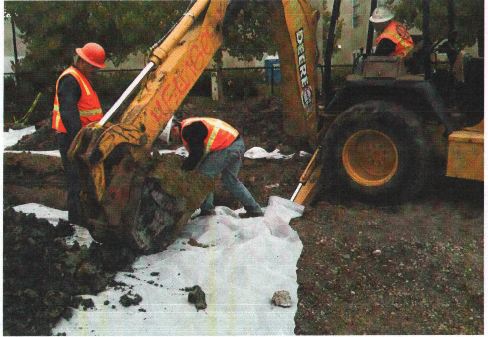
GGT Soil Sampling