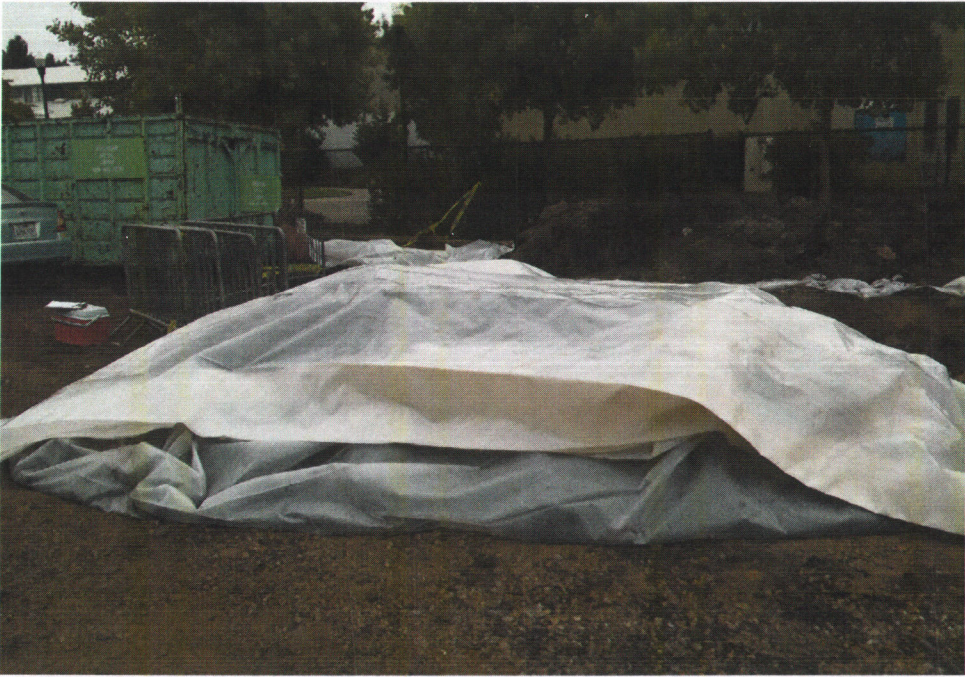
Over-excavation Soil Stockpile