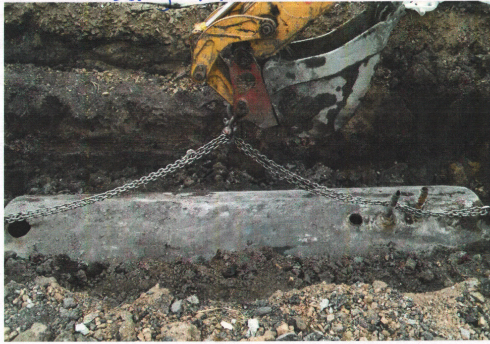
UST being removed