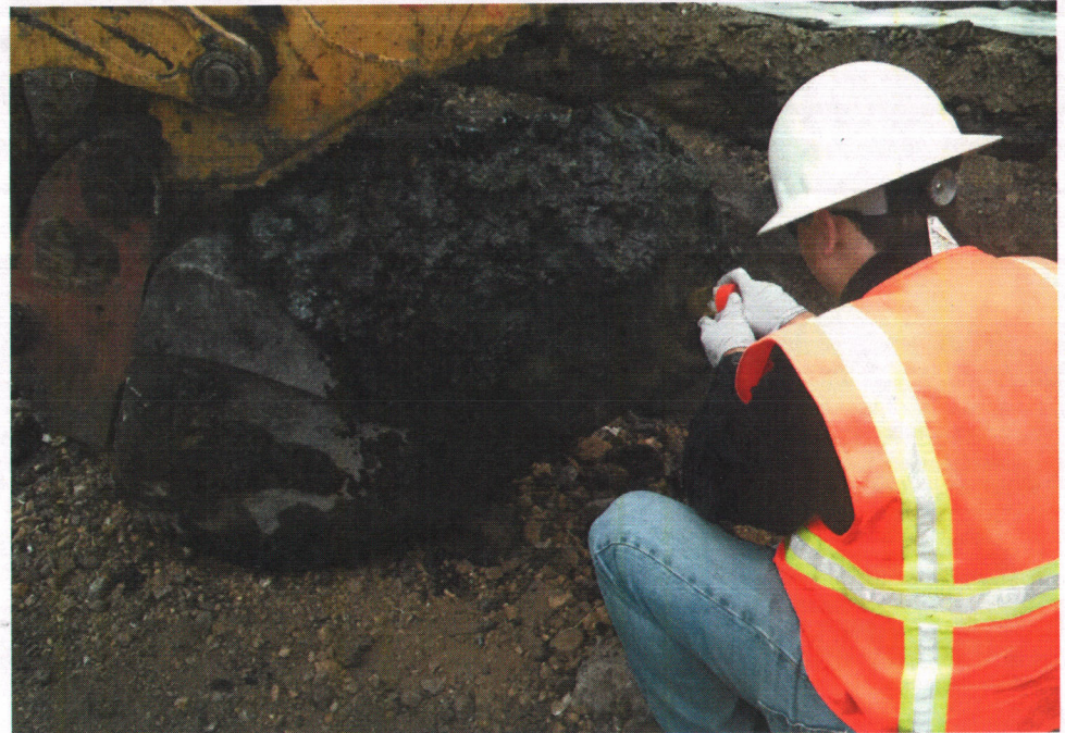
Golden Gate Tank Removal Soil Sampling ↑