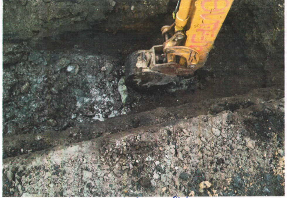
Soil Removal \uparrow \approx 11ft bys