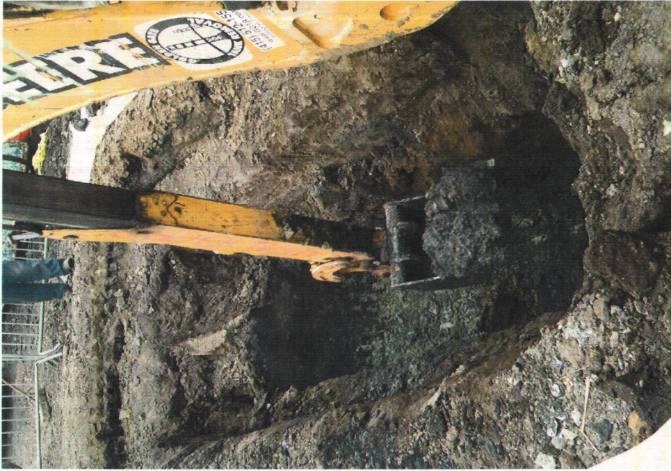
Soil Removal \approx 10ft bys