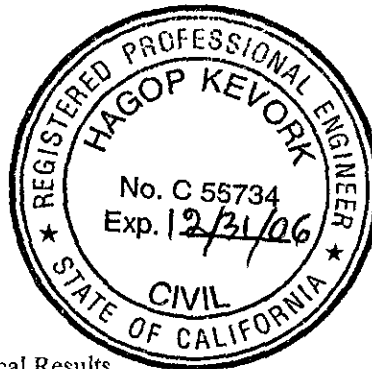
Hagop Kevork P.E. No. C55734

Figure 1: Potentiometric Map Table 1: Groundwater Monitoring Data and Analytical Results Table 2: Field Measurements Attachments: Standard Operating Procedure - Groundwater Sampling Field Data Sheets Chain of Custody Document and Laboratory Analytical Reports