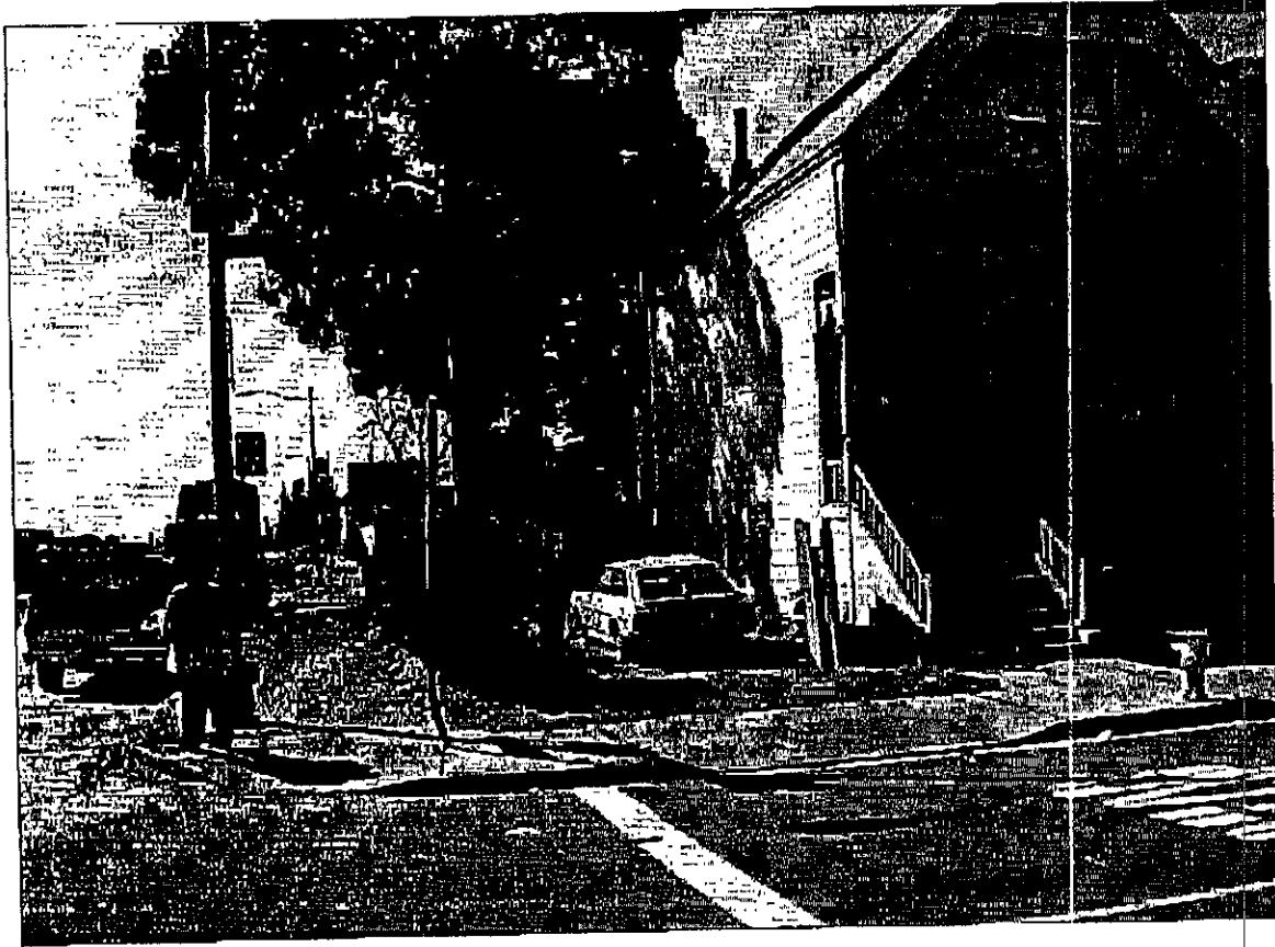
1409 17th Street, Oakland CA