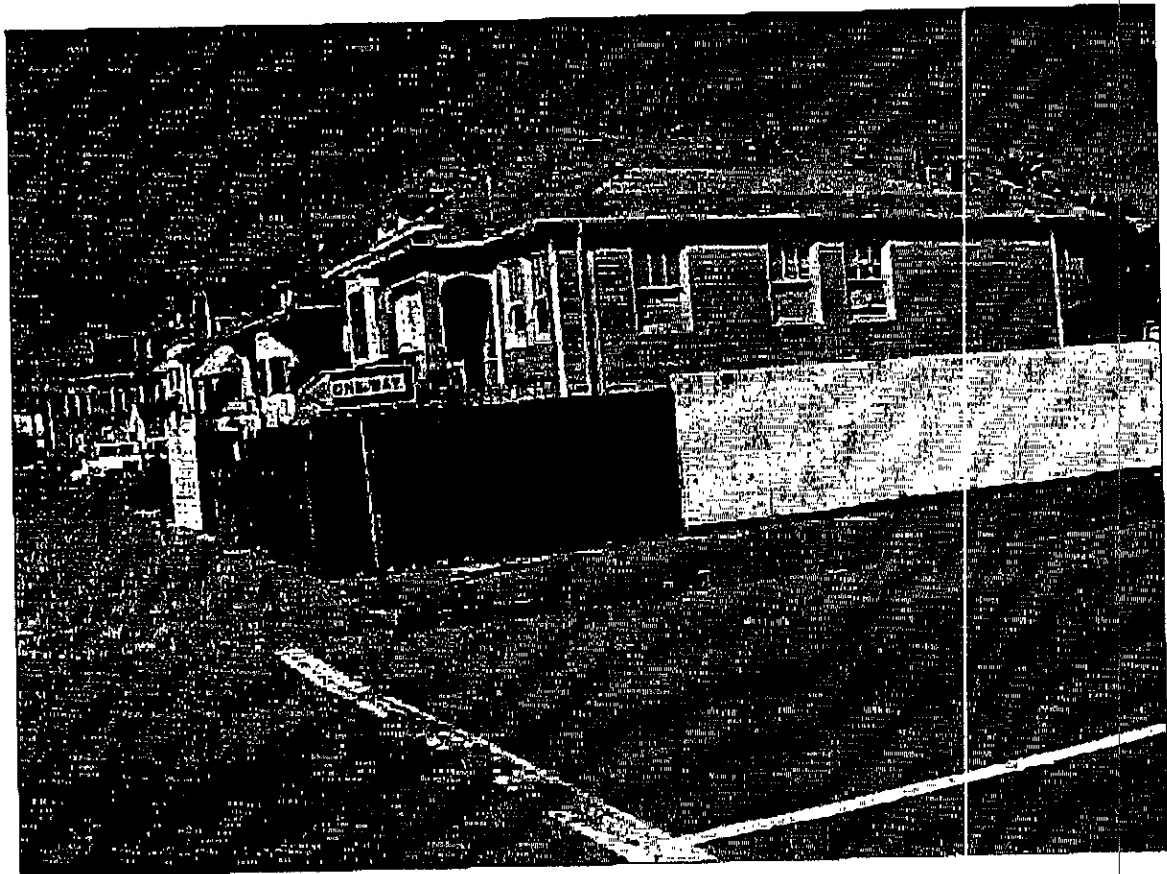
1408 16th Street, Oakland CA