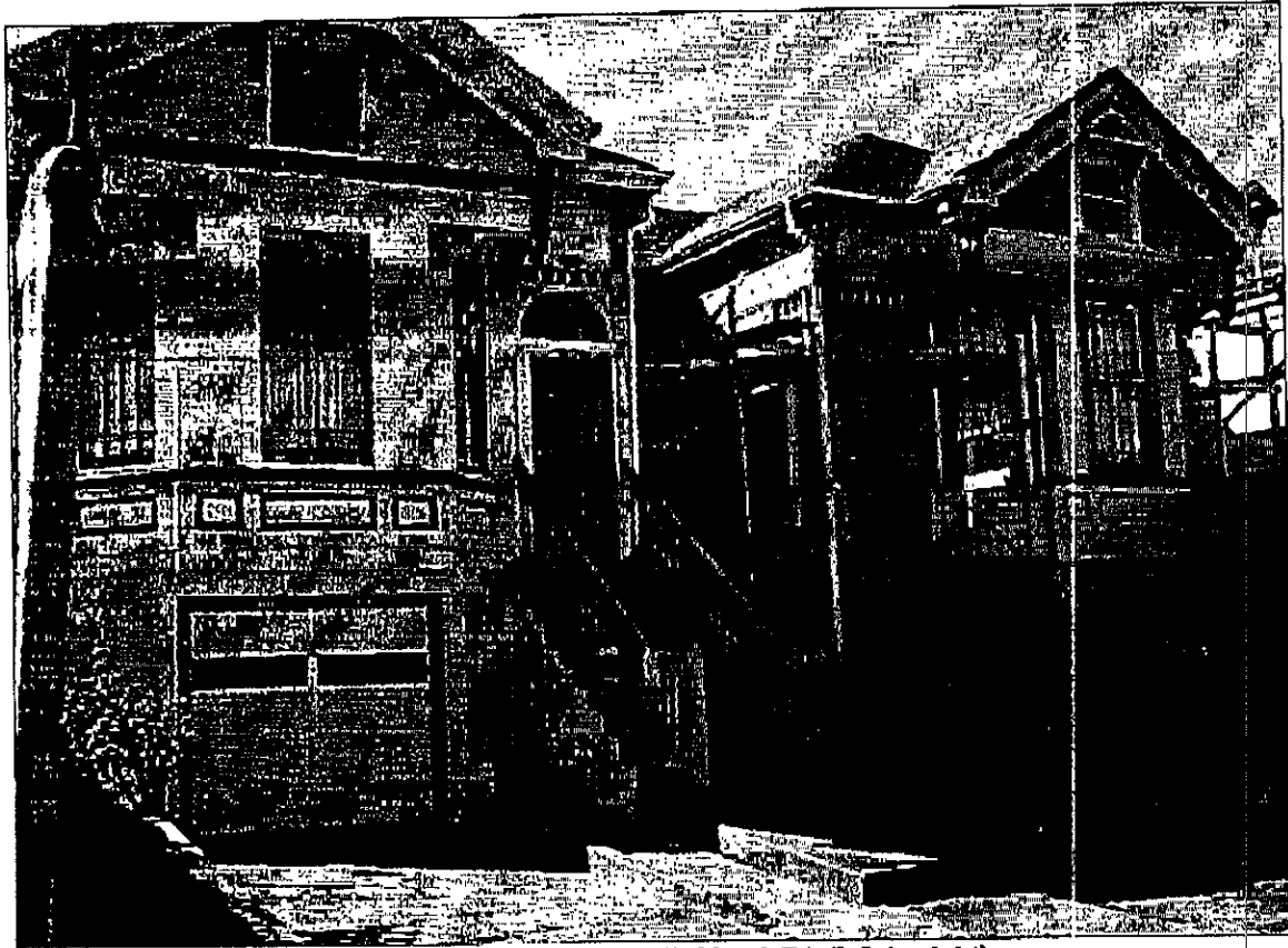
1421 and 1425 16th Street, Oakland CA (left to right)