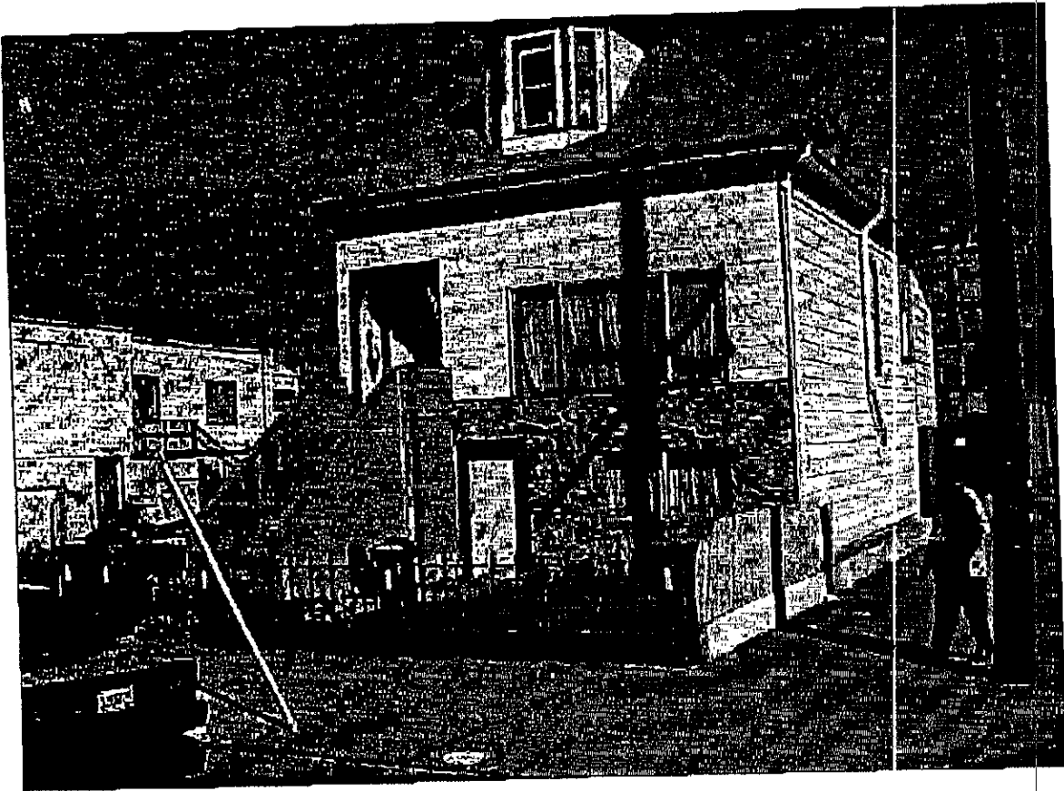
1412 15th Street, Oakland CA