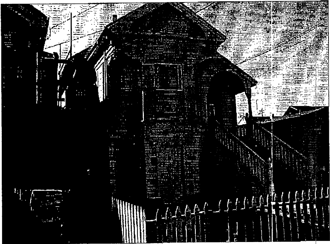
1429 16th Street, Oakland CA