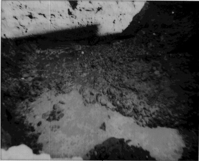
201 2nd St GASOLINE UST