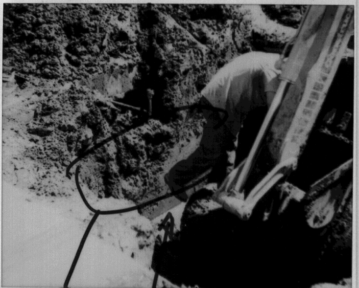
water line groundwater stained soil